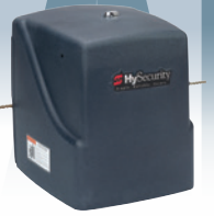
Slide Gate Operator

Ultra Reliable/Low maintenance • Variable speed • Easy, inexpensive installation • Solar